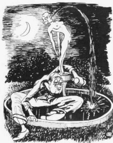
"Think right, baby — get rid of it."