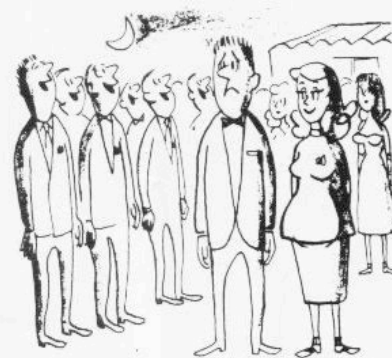
"TELL ME WHY SHE WEARS HIS PIN . . . . TELL ME

"I don't know who I am. I was left on a doorstep."